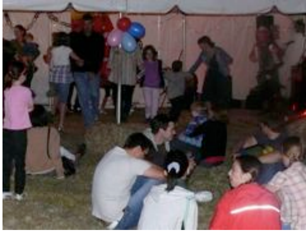
People had a great time, dancing, chatting, eating