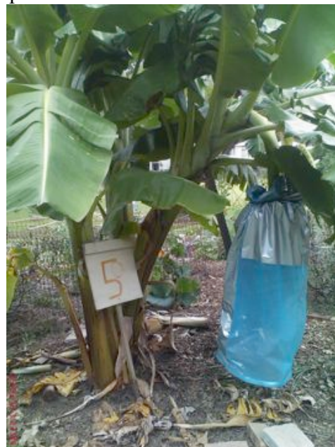
Our first hand of bananas- not ready to harvest yet