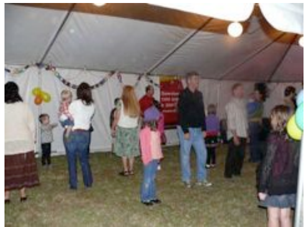
People of all ages lining up for a dance. Q150 banners in the background.