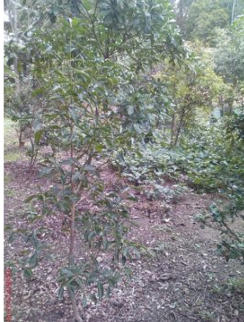
Bush tucker garden is thriving after being planted in November-December