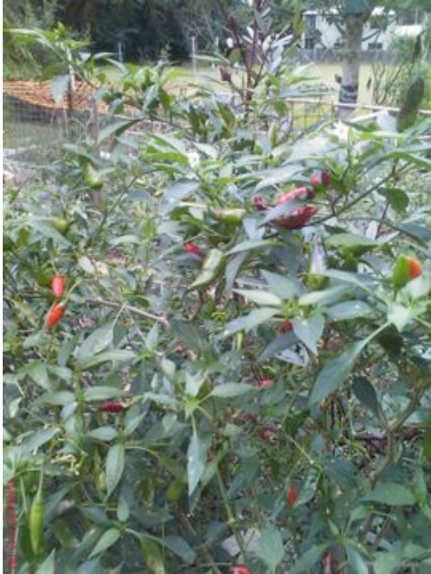
Chillies ready to harvest