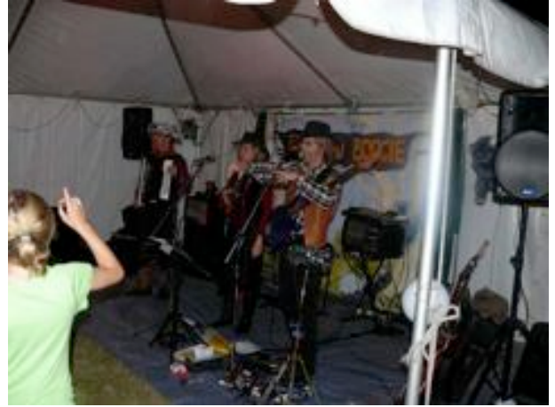
The Bushland Boogie band played up a storm