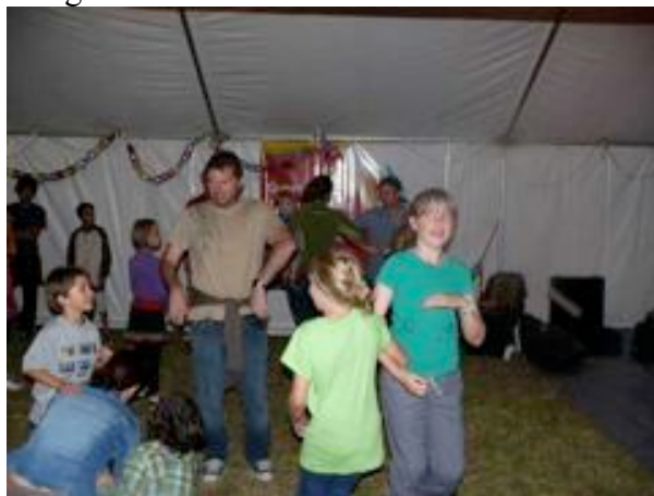
The Chicken Dance was a favourite with the kids